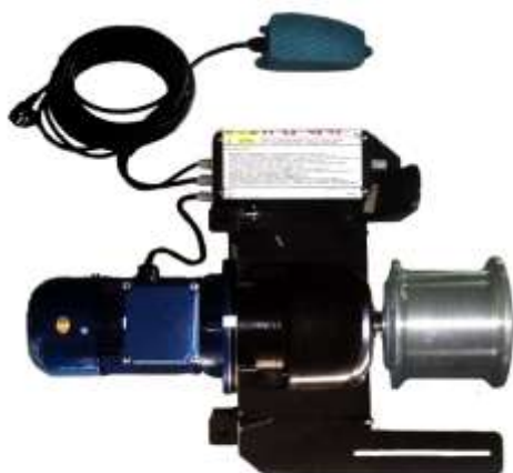
Single phase, 220V, 5A with electronic digital controller system